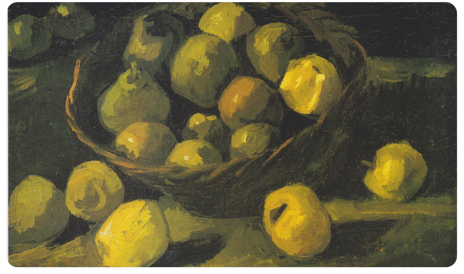
Still Life with Basket of Apples by Vincent van Gogh, 1885

Tints and shades are used in paintings to create light and shadow. This painting by Vincent van Gogh is a good example of the use of tints and shades. The apples in the foreground are painted in tints of green to emphasise light. The apples in the background are painted in shades of green to show that they are in the shadows.