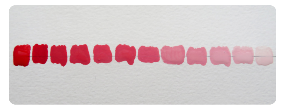
tints of red

A tint is a colour mixed with white. The more white paint that is added to the original colour, the lighter the tint. A tint can range from slightly lighter than the original colour, to almost white. When mixing a tint, begin with the pure colour and add white paint a tiny bit at a time.