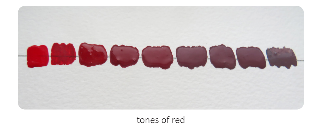
Mixing tints, shades and tones

A tone is a colour mixed with grey. Tones are less vibrant than the original colour. Using a tonal colour in a painting balances other intense colours and bright hues. When mixing a tone, begin with the pure colour and add grey paint a tiny bit at a time.